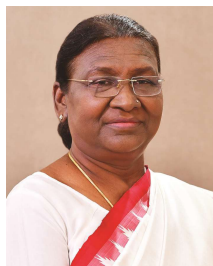
Smt. Droupadi Murmu President of India, The Visitor